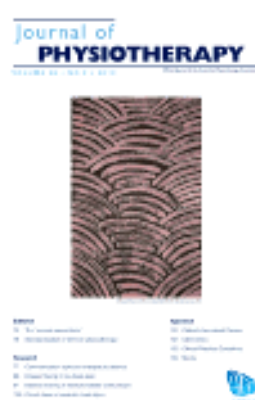
Journal of Physiotherapy