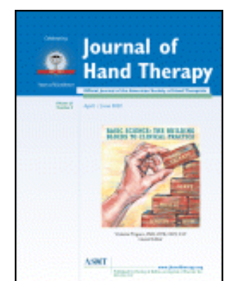
Journal of Hand Therapy