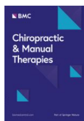
Chiropractic and Manual Therapies