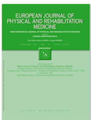
European Journal of Physical and Rehabilitation Medicine

You have access to online journals using your OpenAthens details. You can browse journals using the NHS Knowledge and Library Hub . Here are some of the journals available to you: